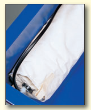
DYNA TRAP FILTER