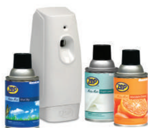
3000 ULTRA DISPENSER (068910)