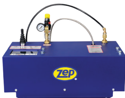
Package: 1/case Zep Part #: 700040001

It is also one of the most competitive segments. This system offers a superior way to cut your cost of business by providing a cost effective and “environmentally aware” solution!